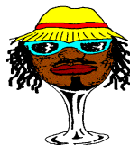
Calypso (Tia Maria)