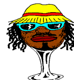
Calypso (Tia Maria)