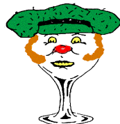
Irish Cream (Baileys)